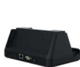
E10/E12 Desktop dock AT-CAE1201 AT-CAE1201K

Rugged, ethernet port, RS232 port, communication and charging base. Possibility to have high-performance versions ( ICore 5).