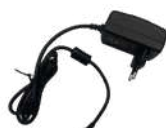
Power adapter AT-CAE805