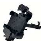
E10B Vehicle dock with key lock, Ethernet, DC jack, 2 USB, RS232 DB9, kit fixation AT-CAE1011B AT-CAE1011B1