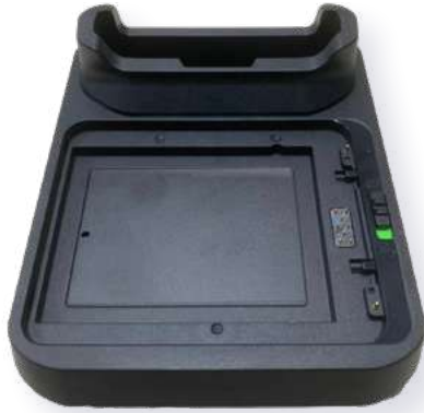
Single Charging cradle P/N : AT-CAE6502

The E65 box include the E65, a battery, a power supply, a USB-C cable , a handstrap and a protective screen already installed