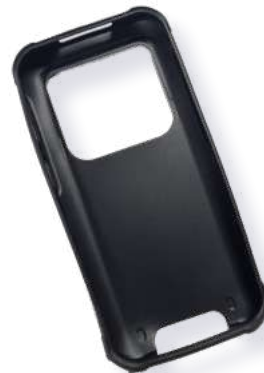
Bumper P/N : AT-CAE6505