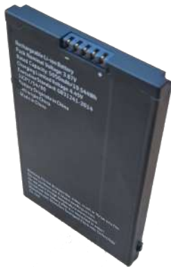
Battery P/N : AT-CAE6501