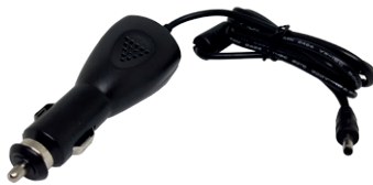
Cigarette light adapter AT-CART11012