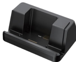
Destock Dock AT-CART11001