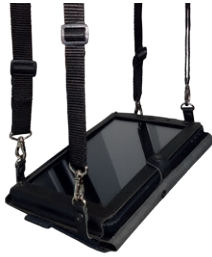
Harness carrying case AT-CART11005