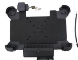
Vehicle Dock AT-CART11002