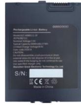
Battery 10800 mA AT-CART11002