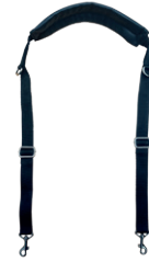
Shoulder strap AT-CAE1207