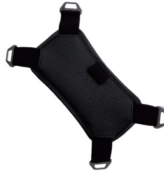
Hand strap AT-CART11003