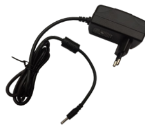
Batterie 5000mA n3.7V AT-CAE805