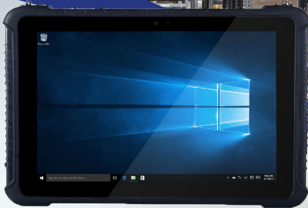
10.1" Tablet Windows 10