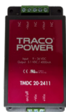
DC Converter AT-CAE1005