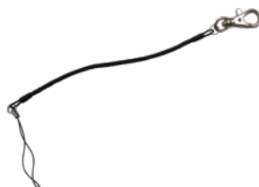
Stylus attachment AT-CAE806