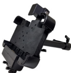
vehicle dock AT-CAE1011B