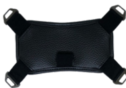
Hand strap AT-CAE1006