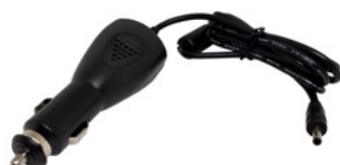
Cigar cable charger AT-CASPA4308