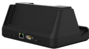
Desktop Dock AT-CAE1201