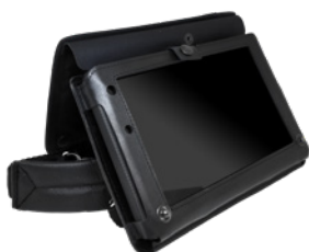
Harness Carrying Case